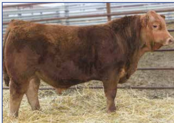
CMR PROTEGE 121E ET SIRE OF LOT 80