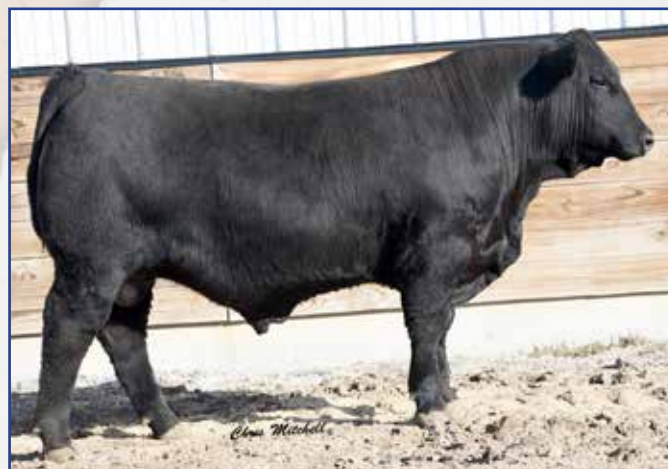
LOT 27 • DBGR 988G

AOD: 4 Dam Wt: 1187 %BWV: 60.32% Udder: 8/8 Doc: 1 Adj. SC: 37.8 Sound structured, heavy muscled, and attractive Cowboy Up son who excels from a growth and performance standpoint. He ratio'd 105 for weaning and 105 for yearling. He also ranks in the top 15% of the breed for yearling weight.