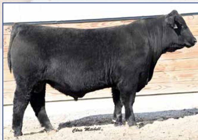
LOT 14 • DBRG 930G

AOD: 6 Dam Wt: %BWV: Udder: Doc: 1 Act. SC: 34 This bull catches your eye when you walk into the pen. He also ranks in the top 20% of the breed for both weaning and yearling weight.