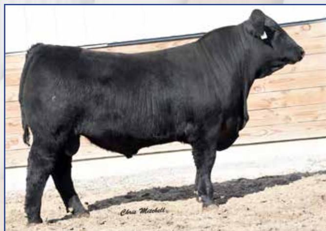
LOT 42 • DBGR 9170G

AOD: 13 Dam Wt: ET %BWV: ET Udder: ET Doc: 1 Adj. SC: 40.6 Look at write-up on Lot 29. Sound, deep, thick, and good describe this herd bull. I am really impressed with this flush if you can't tell by now. Bigtime spread bull that ranks in the top 2% of the breed for Marbling and top 4% for Feeder Profit Index.