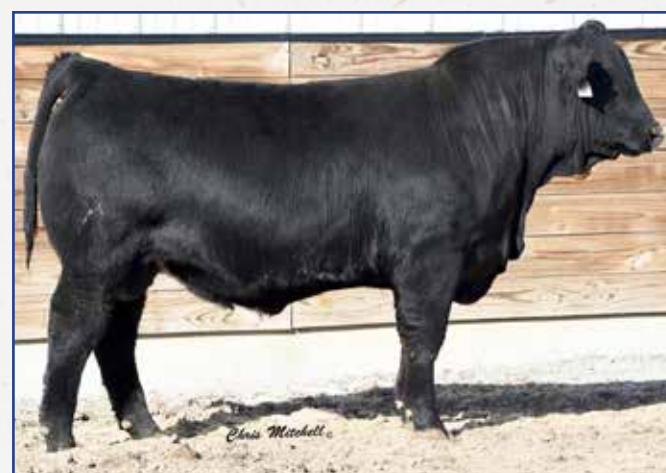
LOT 36 • DBGR 9131G

Look at this extreme heifer bull that still is in the top 20% of the breed for weaning weight. He is out of a picture perfect balancer cow and he ranks in the top 5% of the breed for Feeder Profit Index.