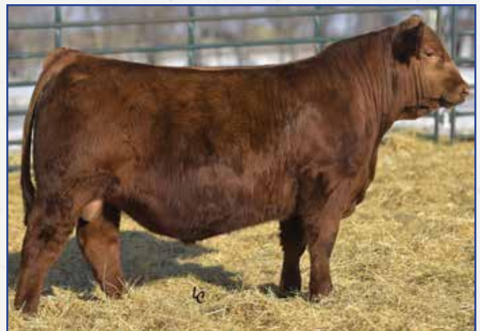
EGL DAY MONEY D047 ET SIRE OF LOT 99

AOD: 4 Dam Wt: ET %BWV: ET Udder: ET Doc: 1 Adj. SC: 43 Heavy muscled and high performing describe this Gladiator son out of 5129C. I was hoping for more red bulls out of this flush. He is all about performance ranking in the top 5% for weaning weight and top 4% for marbling. He also ranks in the top 3% for Feeder Profit Index.