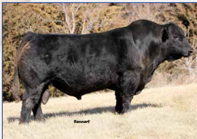
BTBR NEVADA SIRE TO LOT 65

AOD: 3 Dam Wt: 1102 %BWW: 64.16% Udder: 8/8 Doc: 1 Adj. SC: 37.9 Yogi son out of a Nevada dam that is a 7 for 7 bull being born in the 70's and weaned in the 700's. This bull excels from a growth standpoint ranking in the top 5% of the breed for weaning weight. He also excels in marbling - top 5% of the breed and ratio'd 153 for IMF. Top 2% for Feeder Profit Index.