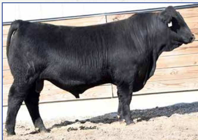
LOT 41 • DBRG 9165G

AOD: 8 Dam Wt: 1530 %BWV: 44.90% Udder: 7/7 Doc: 1 Adj. SC: 39.6 Big framed, long bodied Epic son that excelled in his IMF scan. We used Epic to add growth and marbling. This bull will do that. Top 10% of the breed for marbling.