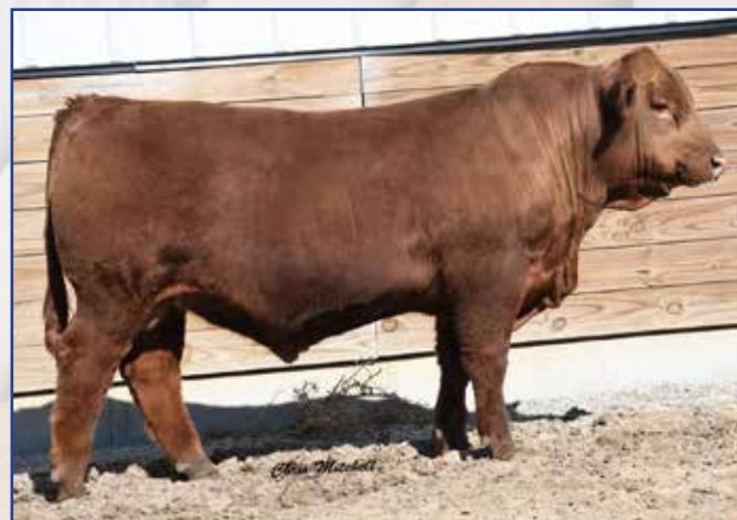
LOT 84 • DBRG 970G

AOD: 5 Dam Wt: 1319 %BWV: 50.87% Udder: 8/8 Doc: 2 Adj. SC: 36.4 Sound structured, heavy muscled, and deep bodied bull that ranks in the top 10% of the breed for weaning weight and ratio'd 105 for ribeye. Top 10% for Feeder Profit Index.