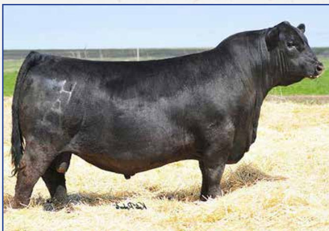
HA COWBOY UP 5405 SIRE TO LOT 26 & 31