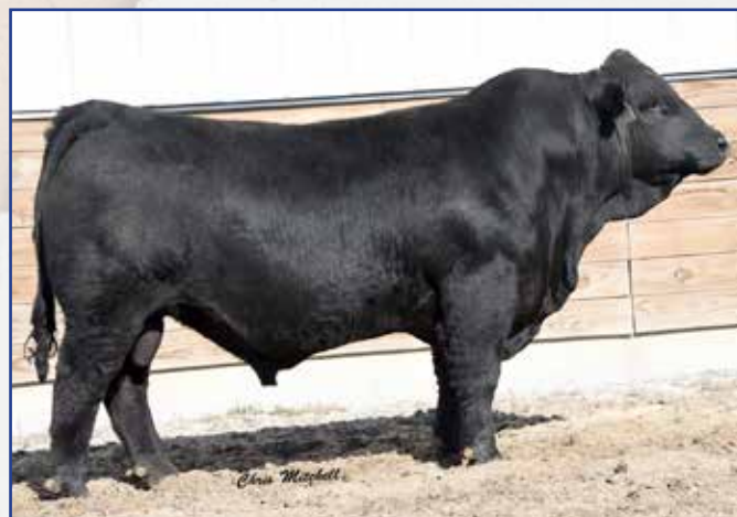
LOT 1 • DBRG 8472F

AOD: 3 Dam Wt: 1360 %BWW: 41.40% Udder: 8/8 Doc: 1 Act. SC: 35.5 Thick, deep bodied, and sound structured describe this bull. Take a look at his video - he is a meat wagon. The dam of this bull is also the dam of 710E. You will see his progeny all over in this sale catalog.