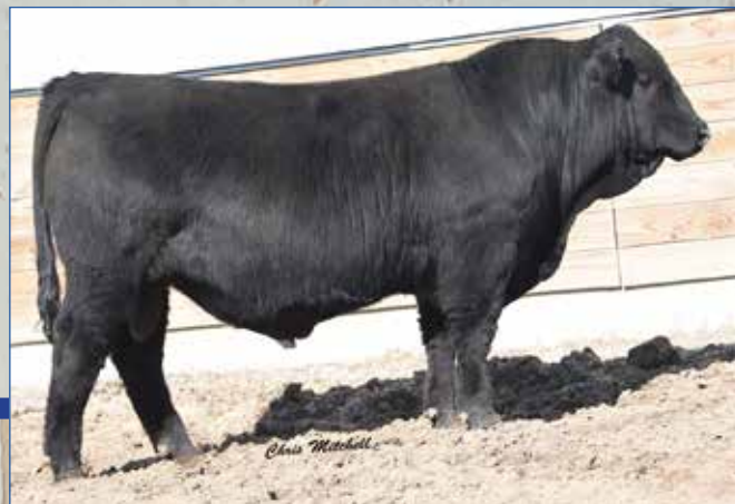
LOT 71 • PUREBRED