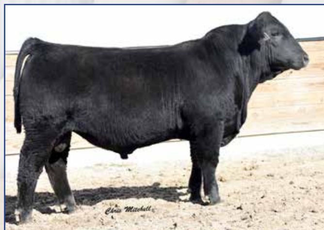
LOT 15 • DBGR 932G

AOD: 2 Dam Wt: 1464 %BWV: 50.61% Udder: 8/8 Doc: 1 Adj. SC: 36.2 A ¾ blood that is flat attractive out of the 7195E bull we sold to Ginger Ertel. We only had 2 bulls out of him and both are at the top end of our bull sale. This bull does everything well. Top 15% for calving ease, top 20% for yearling weight and top 3% for Feeder Profit Index.