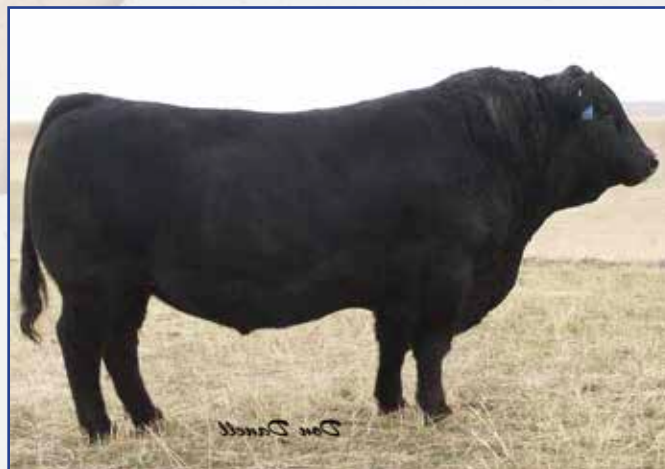
BOLTON PAY DAY 45C SIRE OF LOT 76

Heifer bull deluxe. You can drive the wheels off your pickup trying to find a purebred with this much calving ease. Out of one of my favorite cows on our place. This bull ranks in the top 1% for calving ease, top 3% for marbling and top 1% for Feeder Profit Index.