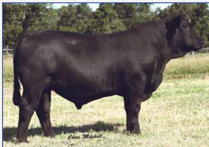
CAROLINA EXCLUSIVE 1230Y SIRE OF MULTIPLE PB BULLS DAMS.