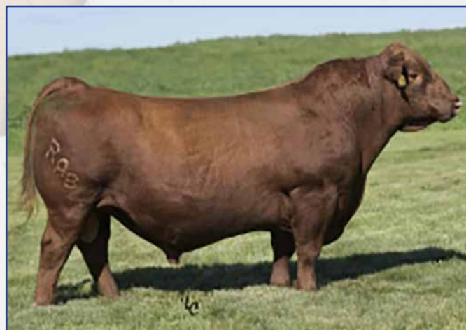
BIEBER HARD DRIVE Y120 SIRE OF LOT 101

AOD: 6 Dam Wt: ET %BWV: ET Udder: 8/7 Doc: 1 Adj. SC: 41.7 Big framed and sound structured ET bull out of Hard Drive. He ranks in the top 15% for birth weight and top 15% for weaning weight.