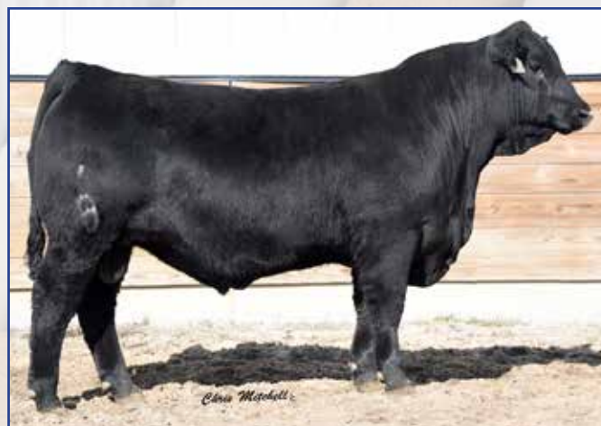
LOT 34 • DBGR 9128G

You will not miss this meat wagon when you step into the pen. These 710E cattle are flat good. Top 3% of the breed for growth traits. He nursed a 7 year old dam who has a perfect udder. This bull checked the box in every category we look for. His dam has ratio'd 99 on birth and 104 on weaning for 6 calves.