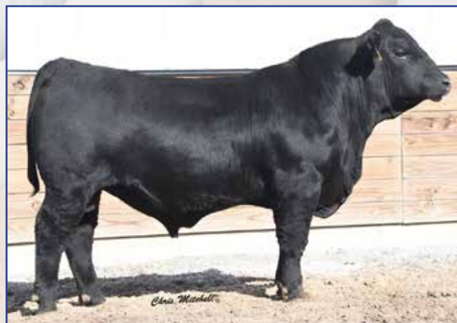
LOT 68 • DBGR 8501F

This is a very interesting pen of Purebred bulls. There are several differences between them. We have some big and high performing ones, while others are more calving ease. We have a Twister son to lead them off, but we also have several sons out of Destination, which is a calving ease Purebred bull we purchased from Sandy Knoll Farms. I think we have combined some top cow families in this set - L643 who is the mother of Sam, Roxi who has been a great donor for us for many years, and 6044 who is the mother of Nevada. All of these bulls are sire verified. All of these bulls have genomic enhanced EPD's. The AVERAGE of this group is top 25% for calving ease, top 29% for Yearling weight, top 18% for Calving ease maternal, top 27% for carcass weight, top 19% for marbling, and top 11% for Feeder Profit Index.