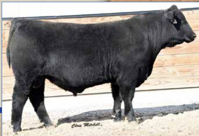
LOT 14 • BALANCER®

Please bring this catalog with you on sale day.