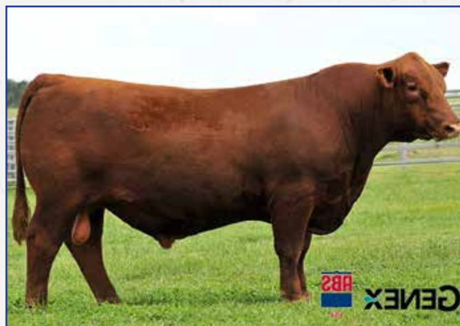
JEFFRIES GLADIATOR 24C SIRE OF LOTS 82 & 83

AOD: 2 Dam Wt: 1119 %BWW: 65.59% Udder: 9/9 Doc: 1 Adj. SC: 43.4 This bull weaned off his dam at 65% of her body weight. He is a spread bull that ranks in the top 10% for birth weight and top 10% for weaning weight. Top 15% of the breed for Feeder Profit Index.