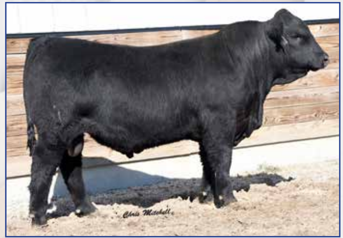
LOT 29 • DBGR 995G

This big framed bull is deep bodied, heavy muscled and sound structured. It is tough to pick a hole in this bull. Look at his adjusted scrotal of 42.4.