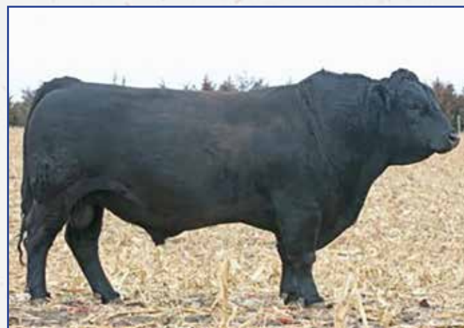
DBGR TWISTER 451B SIRE OF LOT 68 & MGS OF LOT 69