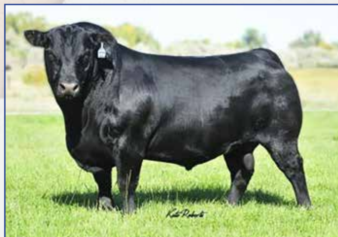
CAPITALIST 316 SIRE OF LOT 61

AOD: 5 Dam Wt: 1283 %BW: 46.61% Udder: 8/9 Doc: 1 Adj. SC: 38.9 Heifer bull specialist that also ranks in the top 1% of the breed for Calving ease maternal. He is a more moderate framed bull who ranks in the top 20% of the breed for Marbling and top 20% of the breed for Feeder Profit index. He nursed a 5 year old cow with a beautiful udder.