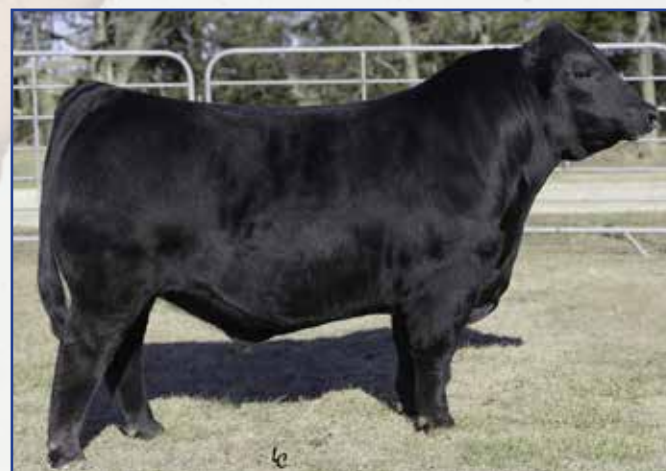
EGL LIFELINE B101

Long bodied and high performing Lifeline son. He weaned off over 700 pounds that will add pounds and length to your calves.