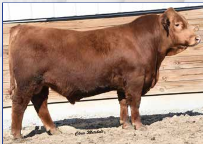
LOT 90 • DBRG 9115G

This bull combines 2 of the best cow families we have had in L643 and 248Z. We are still flushing 248Z. This bull has checked all of the boxes. His dam has a great udder, he ratio'd 121 for IMF. He is a heifer bull that still is in the top 20% for marbling. This is a red balancer bull we would like to AI to and use in our program.