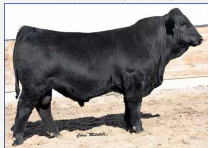
LOT 18 • DBGR 940G

AOD: 2 Dam Wt: 1310 %BWV: 52.29% Udder: 9/8 Doc: 1 Adj. SC: 40.3 Heifer bull out of 710E that ranks in the top 3% of the breed for calving ease. Despite that he still ranks in the top 20% of the breed for weaning and yearling weight. Top 10% for Marbling and top 4% for Feeder Profit Index. Did I mention he ratio'd 171 for IMF?