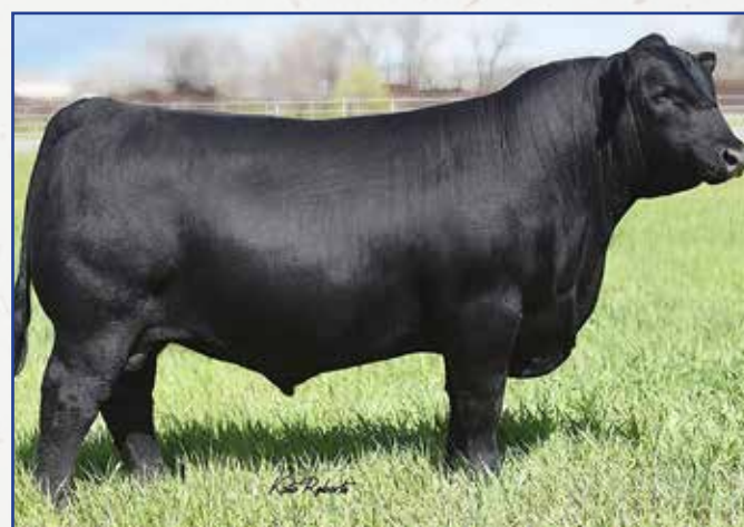
STUNNER SIRE TO LOT 62